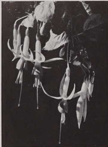
Mrs. Rundle—Hanging Basket Variety

growth and continuous bloom. Probably the most red double fuchsia, particularly brilliant in garden display.